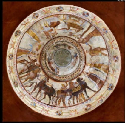
The Thracian Tomb near Kazanlak (a fresco)