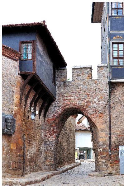
The Gate to the Fortress Hisar Kapiya

Under today's downtown section of Plovdiv lie the ruins of an enormous Roman Stadium with a length of 180 m and with a capacity for 30, 000 spectators. Marble reliefs, pottery and other relics provide evidence of the Bulgarian influence in the city during the Middle Ages.