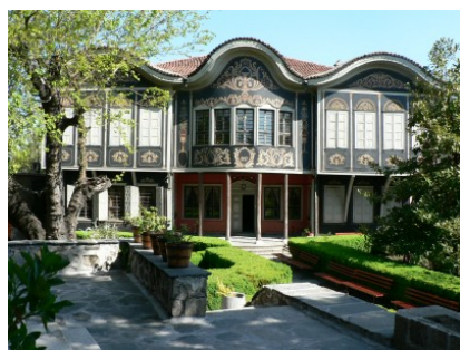
The Ethnographic Museum

Plovdiv State Opera was established in 1953. Its repertoire is aimed mainly at the introducing to the great achievements of the European