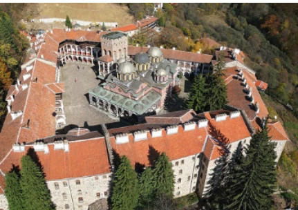
The Rila Monastery

Until recently, the Thracians were considered to be the oldest population inhabiting the Bulgarian lands. However, the discovery of the unique necropolis near the lakes of Varna, dating back to the 5th Millennium BC, cast a new light on that issue and brought forward new hypotheses. Over 3000 golden items found there gave reasons to a number of scholars to believe that the first European civilization originated on the shores of Varna lakes.