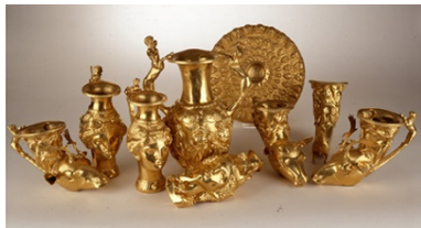
The Gold Treasure of Panagyurishte