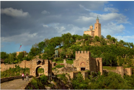
The Tsarevets Fortress in Veliko Tarnovo