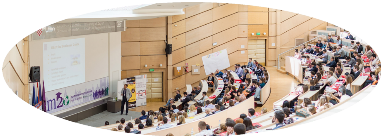
"The best conference for Millennials in Europe"