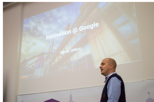
46 speakers and panelists