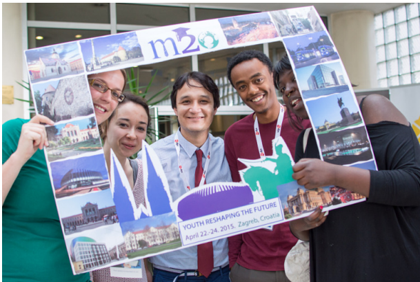
More than 500 youth